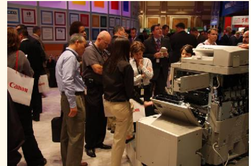
Attendees were given hands-on demonstrations of the new imageRUNNER ADVANCE equipment.