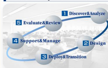
Canon MDS Cycle and Phases

Canon MDS evaluates customer's needs and ensures continuous business improvements through a five phase approach, as depicted in the below graphic.