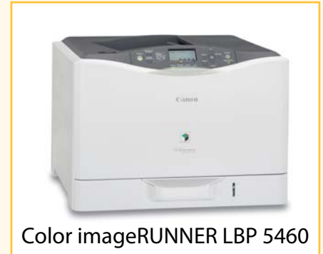
Color imageRUNNER LBP 5460

The new LBP5460 model is a very easy to use, compact device. It consists of easy functionality which include, front load access and simplified maintenance, impressive paper handling and a new user interface. Replacing the all-in-one