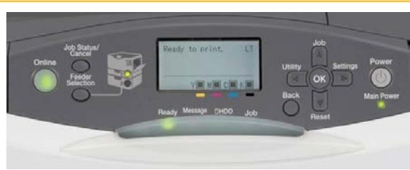
New and easy to use 5 Line LCD display

toner and drum cartridges is also easy through the front access panel and even quicker with Canon's unique auto-rewinding tape seal. The imageRUNNER LBP5460 model features auto duplexing double sided documents and supports up to 850 sheets. Best of all, users will appreciate the clarity of the 5 line LCD display and intuitive control panel of the Color imageRUNNER LBP5460 model. The distinctive panel features on-screen navigation to facilitate device setup, animations to help guide operations, at-a-glance consumable levels, and the status of current print jobs.